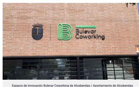
Espacio de Innovación Bulevar Coworking de Alcobendas / Ayuntamiento de Alcobendas

El Espacio de Innovación Bulevar Coworking nace para apoyar proyectos emprendedores y facilitar soluciones de economía sostenible